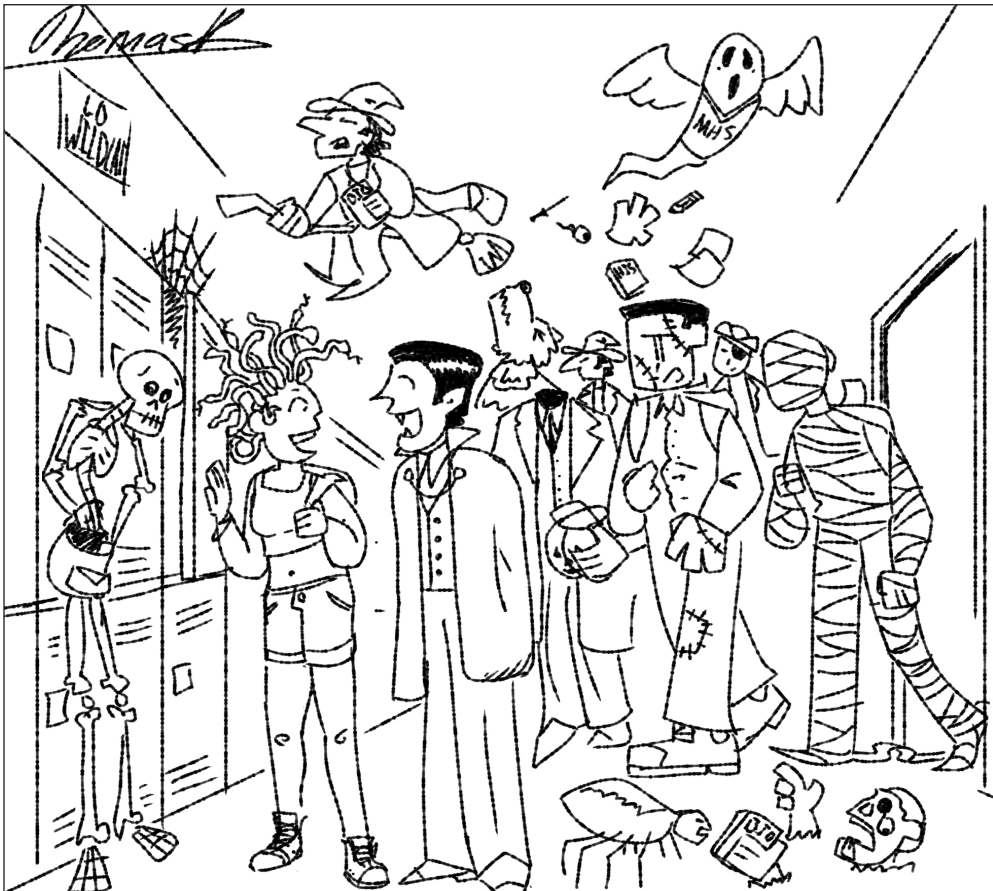
Graphic by THOMAS HAYDEN

The same goes for the faculty. Not only will they be over-